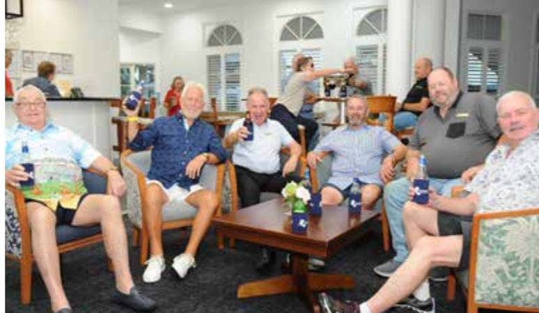
The boys from the 'Naughty Corner'.