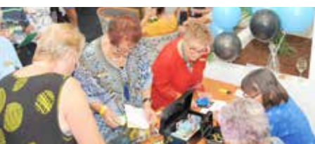
Processing payments from the 'Silent Auction'