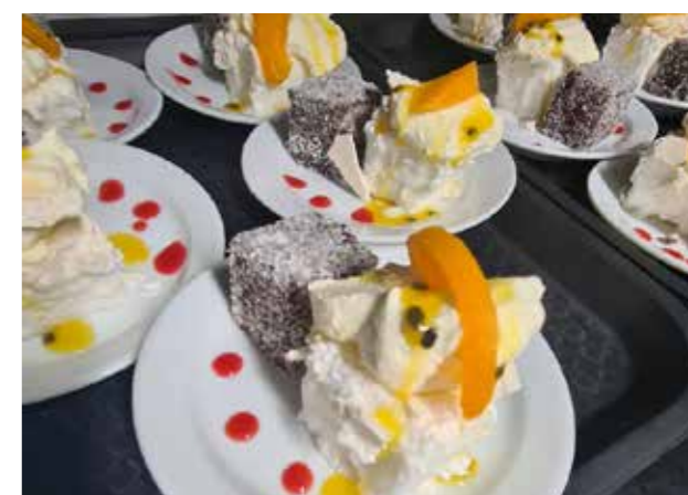
Pictured top: Around the resort grounds. Our lush tropical gardens help make it feel like we're on holidays every day. Pictured middle: With so many great facilities available right here on-site, you don't really need to leave. But when you do, our resort buses can help take you there. Pictured above: Sharon, Amanda and Shella know exactly how to impress our homeowners during weekly meal sittings - yum!