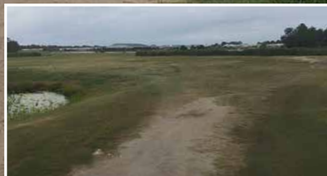
Pictured this page: The 8th fairway in 2020, and now.