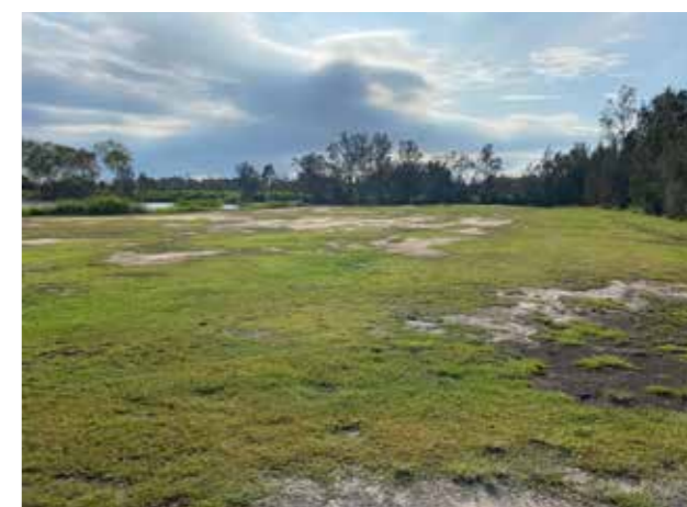
Pictured top row: The 9th hole in 2021 and the 9th hole now. Pictured above: Volunteers spreading top soil and turf on the 7th fairway in June 2022, and the fairway now.