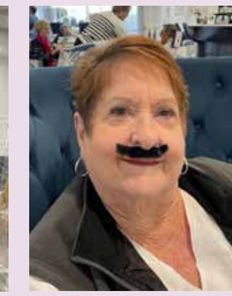
Above: Father's Day. Right: QEII Supper Night.