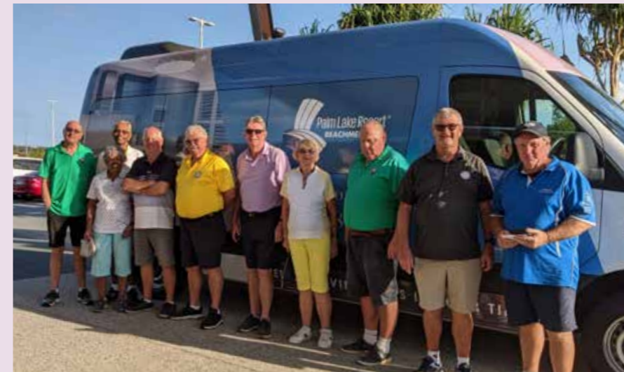
Pictured above: The Maroochy River Veterans (over-50s) two-day golf carnival was held on October 5-6 at the Maroochy River Golf Course. Twelve Palm Lake Resort homeowners participated and it was certainly a challenge on the second day with strong winds affecting everyone's game. However, a good time was had by all. This is an annual event and the Maroochy Golf Club members are very appreciative of our support.