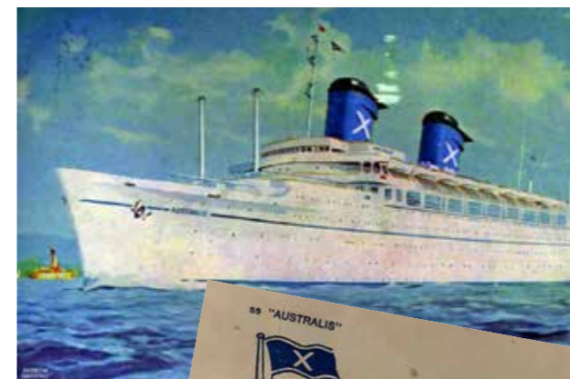
Pictured: The SS Australis memorabilia.