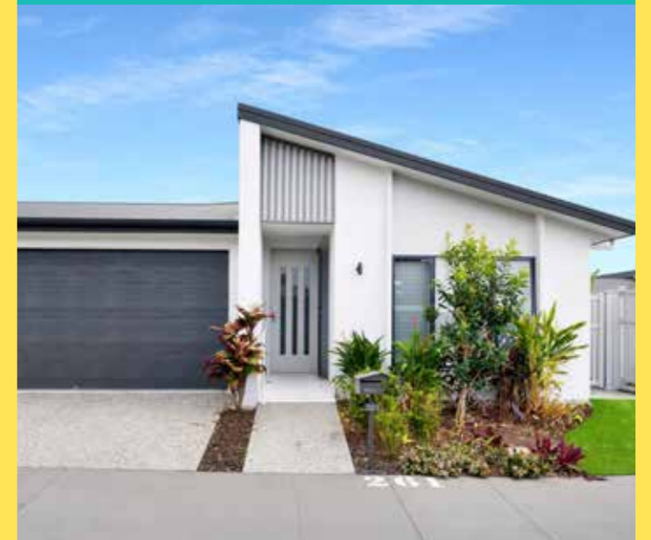
Home 261 $985,000