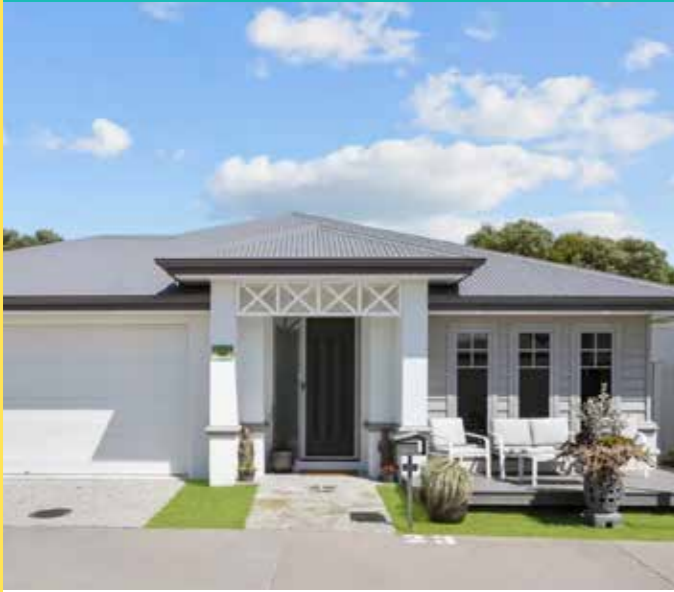
Home 23 $1,175,000+