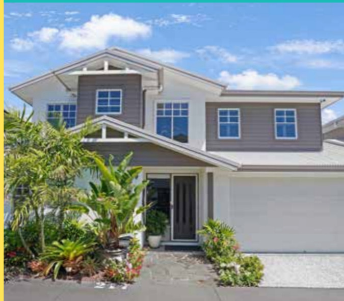
Home 217 $1,485,000