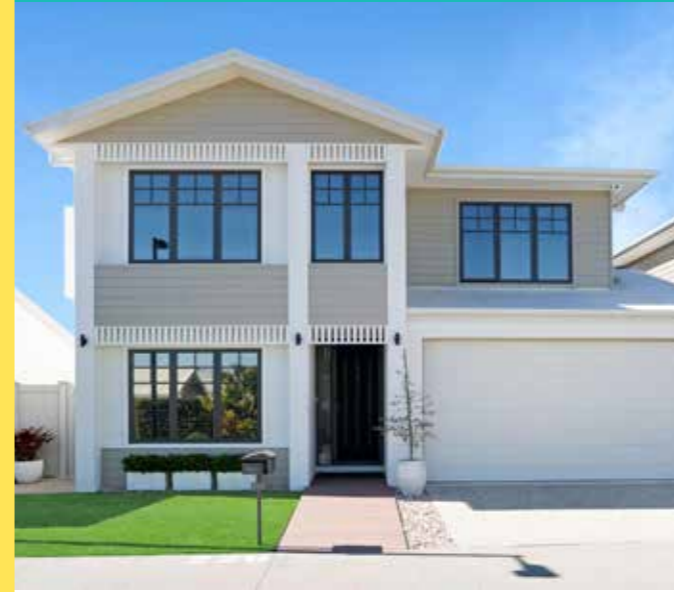
Home 220 $1,600,000