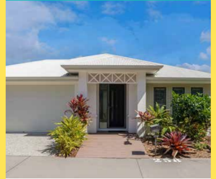
Home 258 $1,250,000