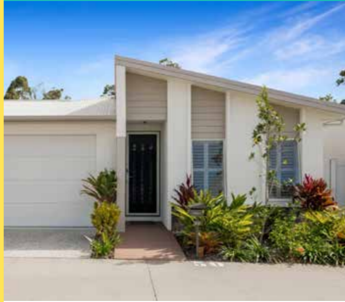
Home 50 $1,150,000