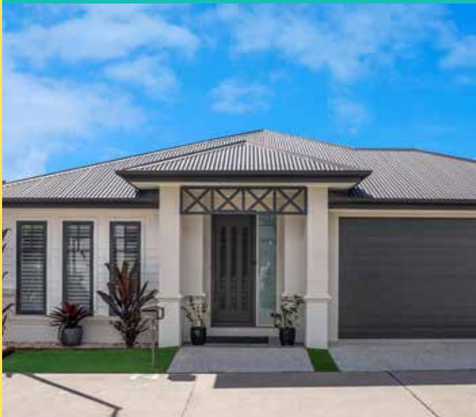
Home 74 $1,349,000