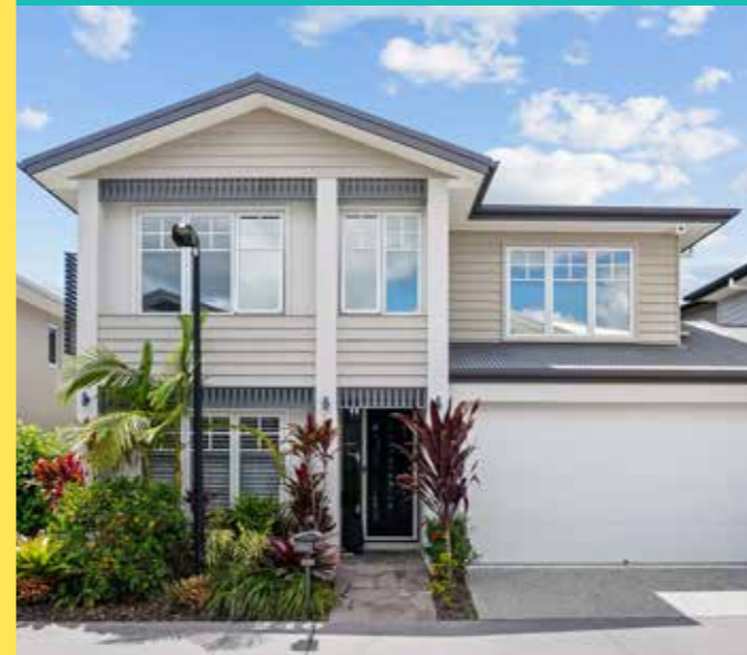
Home 240 $1,450,000