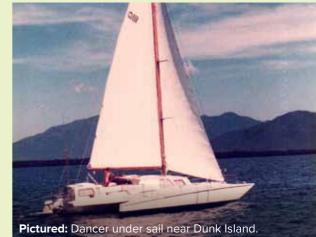
Pictured: Dancer under sail near Dunk Island.

“We both accepted that our sailing adventures were over and settled into life on land,” says Eddie. “We bought our