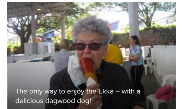
The only way to enjoy the Ekka – with a delicious dagwood dog!