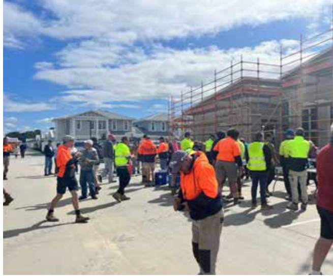
Pictured above and below: When a surge of storm water flowed through our resort in recent months, our Palm Lake Resort family was immediately on board to help with the clean up. These "angels without wings" (who happen to call Palm Lake Resort Tea Gardens home) filled their resort bus and were on our doorsteps within hours. Our local tradies were also brilliant in helping with the mop up - downing their tools and picking up squeegees, mops and rakes instead. Our incredibly grateful homeowners hosted the tradies at a thank-you barbecue recently. They sure do know the way to our tradies' hearts!