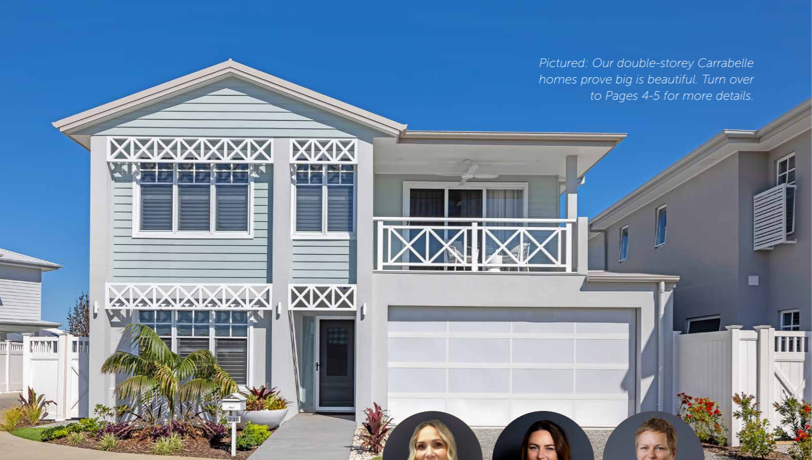
Pictured: Our double-storey Carrabelle homes prove big is beautiful. Turn over to Pages 4-5 for more details.