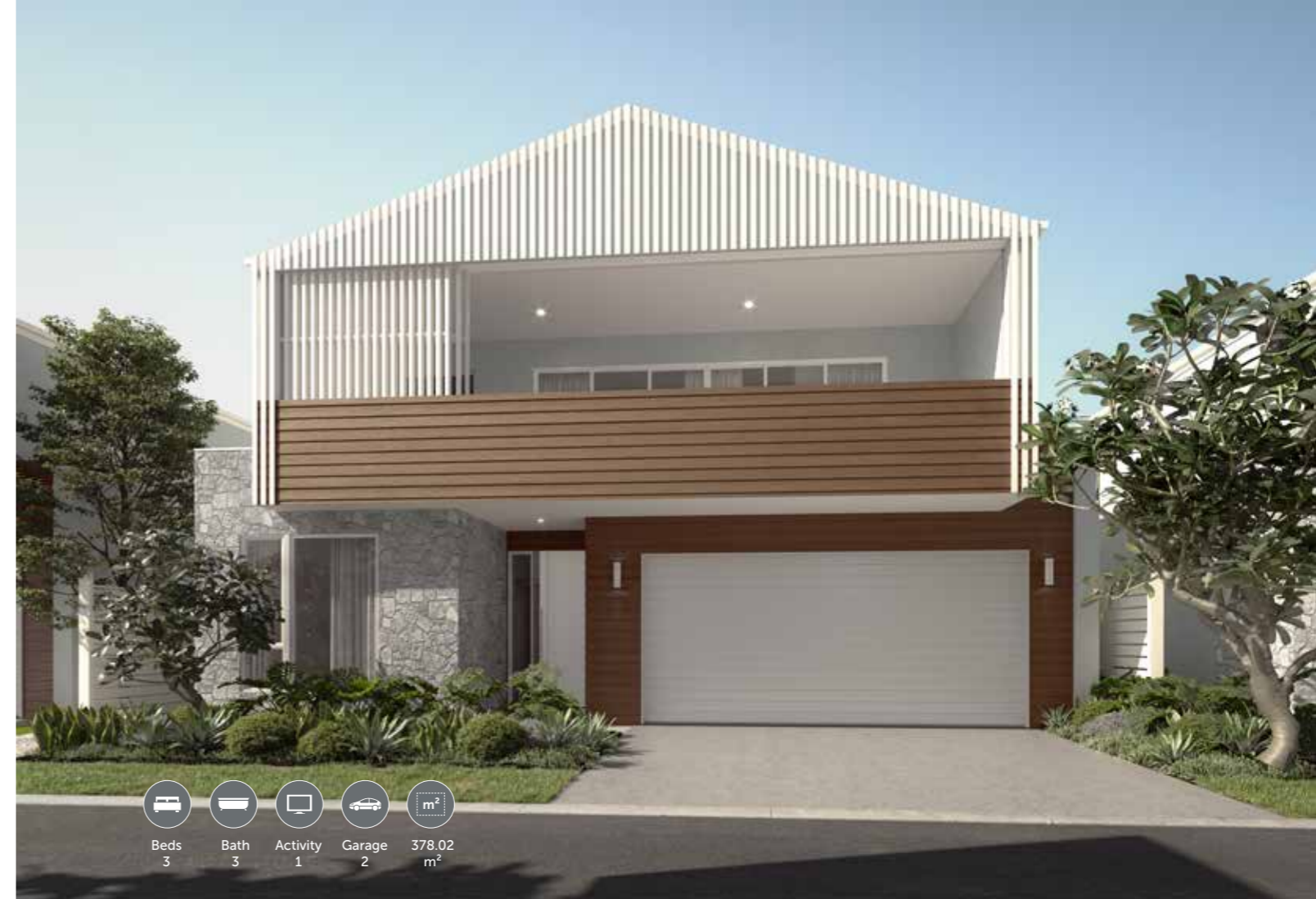
Pictured above: Yamba Cove's "Grafton" home design. Pictured below: The "Maclean" home design offers two alternative facades.

To learn more about these four home designs and the Yamba Cove masterplan, Sales Executive Sandy welcomes you to stop by the Sales Information Centre at 2 Orion Drive, Yamba. It's open seven days a week from 9.30am-4pm. You can also FREECALL 1800 960 946.