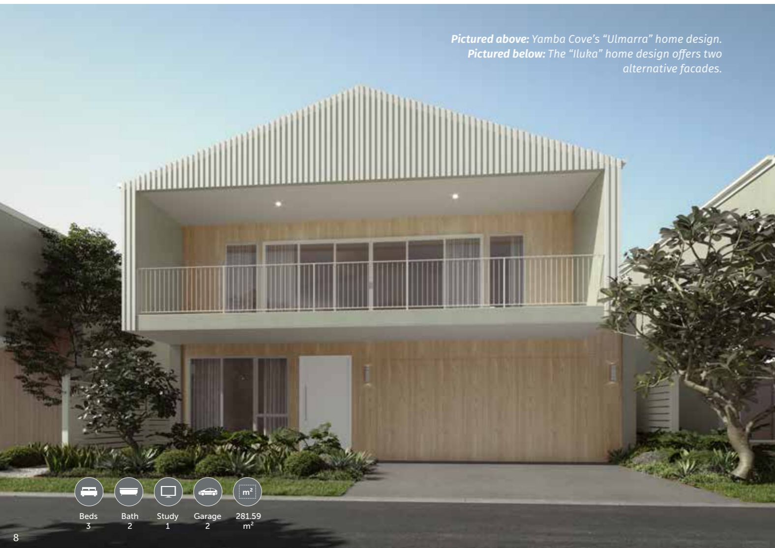
Pictured above: Yamba Cove's "Ulmarra" home design. Pictured below: The "Iluka" home design offers two alternative facades.

Among the grasses chosen are many grey-green toned species such as Blue Oat Grass, along with other Lomandra and Tussock grasses. There will be gorgeous Livistona australis (or 'Cabbage palms') planted enmasse around the Vantage Country Club, and keep an eye out for the giant Canary Island date palms planned for this luxe resort's most grand entrance. All in all, Yamba Cove homeowners will no doubt enjoy that cool, lush, coastal holiday feel every day.