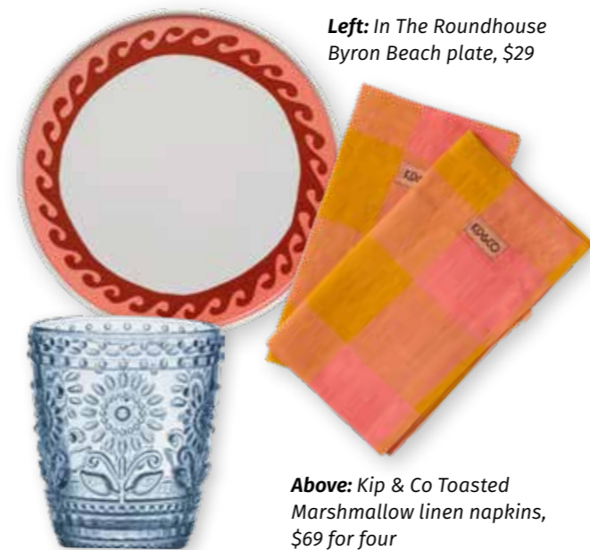
Left: In The Roundhouse Byron Beach plate, $29

Sometimes, depending on the event, an extravagant tablescape can just get in the way. For those occasions, make the food you're serving part of the decoration. Arrange everything down the centre of the table in your best bowls and serving platters. Fill jugs with bright drinks topped with fresh garnish (hello again, seasonal fruit!). If you have any on hand, use your most colourful glassware and dinnerware – if not, pick up some patterned paper serviettes to add a pop of colour. There is no such thing as too much colour in the summertime, as you'll set it all against a crisp white tablecloth. Easy.