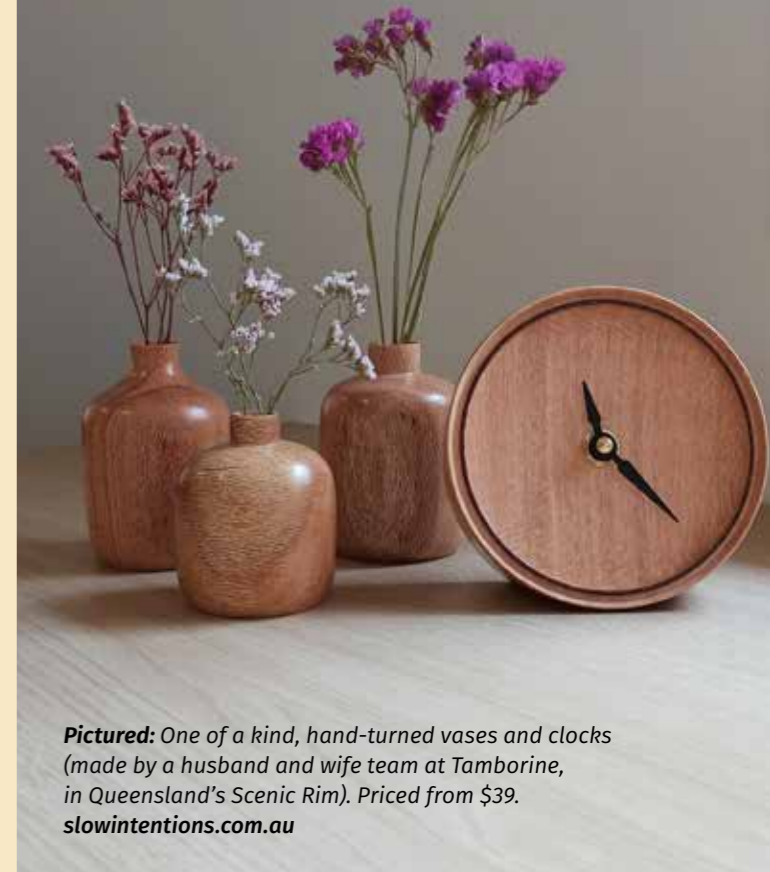
Pictured: One of a kind, hand-turned vases and clocks (made by a husband and wife team at Tamborine, in Queensland's Scenic Rim). Priced from $39. slowintentions.com.au

This is the perfect gift to give to any of your relatives, no matter what generation they are. Think about the recipes you grew up eating or cooking with your family – they may have been midweek dinners, special desserts or favourite drinks. They may also be recipes you made with your children, or even your grandchildren. Write them all down (or type them up) and bind the pages together in a book. You could even make and photograph the recipes or draw the ingredients on each page as decoration. Again, it's the thought that counts!