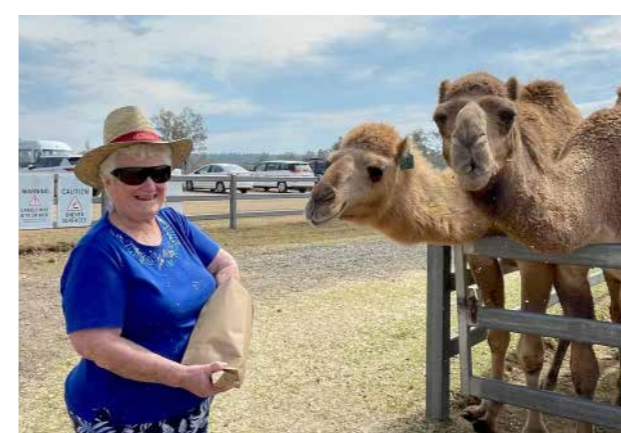
Pictured above: There's no shortage of animal therapy opportunities across our care communities. Sometimes the animals come to us - like when these alpacas stopped by our Bargara community, or when the chick-hatching program at Bethania caused much excitement in recent months! And other times, we love to visit the animals - like when our Mt Warren Park residents enjoyed a day trip to a very hands-on camel farm!