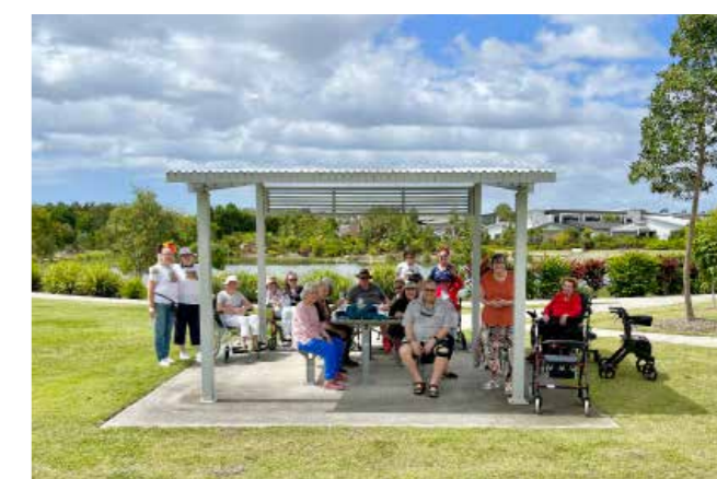
Pictured bottom: Our Deception Bay residents are blessed to call a seaside suburb their home, while our Caloundra residents, below , also have a picturesque backyard.