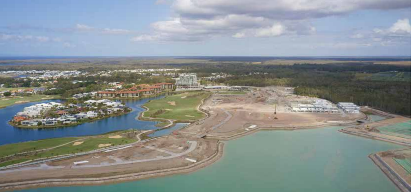
Pictured: A bird's eye view of our construction site. Palm Lake Resort Pelican Waters is really taking shape.