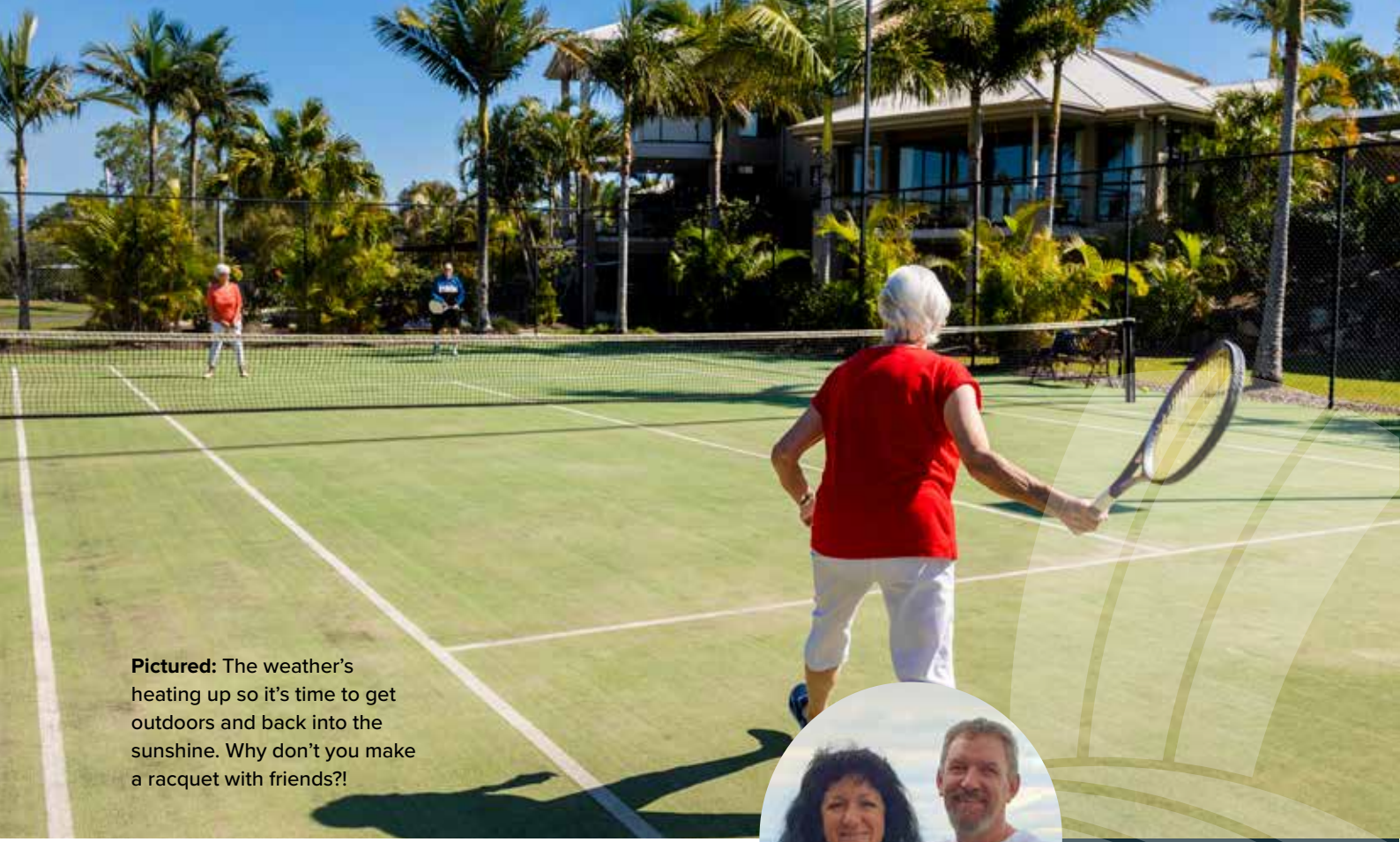
Pictured: The weather's heating up so it's time to get outdoors and back into the sunshine. Why don't you make a racquet with friends?!