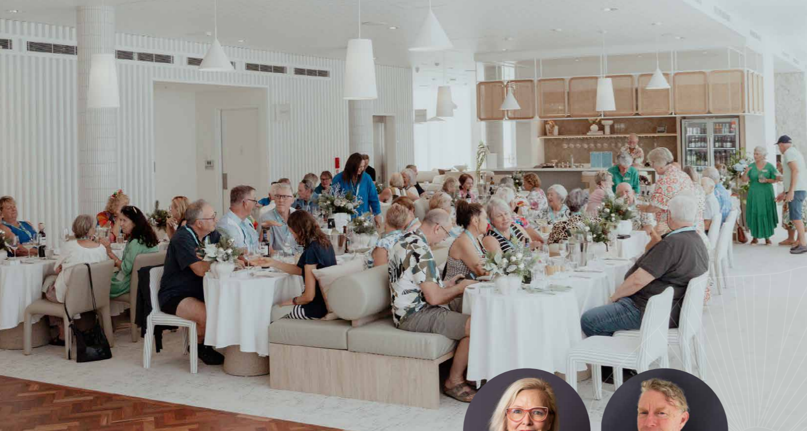
Pictured: Vantage Country Club looked a pretty picture at Christmas, didn't it? Did you see the dining area in full festive glory for our homeowner party? Turn to Pages 8-9 for some wonderful memories.